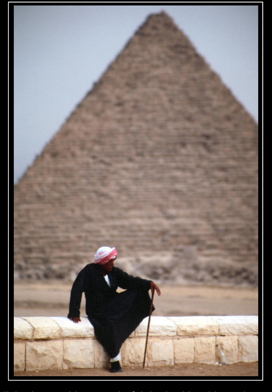
● If you have accomplished something wonderful, look with pride and serenity on your deeds. ⑤ Elderly gentleman sitting in front of Chepren-Pyramid of Giza seems hardly aware of this world famous landmark (Cairo) – November 2012