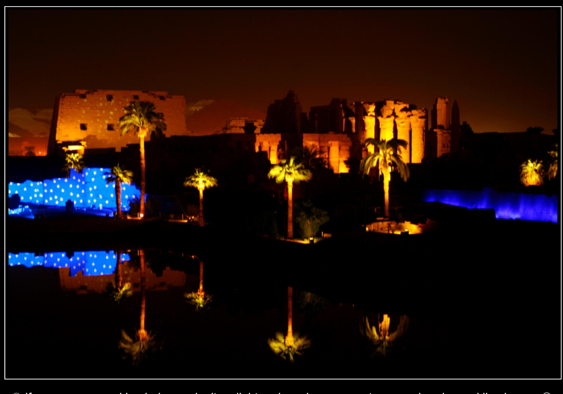
• If you are wrapped by darkness, ignite a light and see how many stars are already sparkling in you. © The light show at Karnak Temple lets Egypt's history shine in the wildest colors up till the Valley of the Kings (horizon) – November 2012