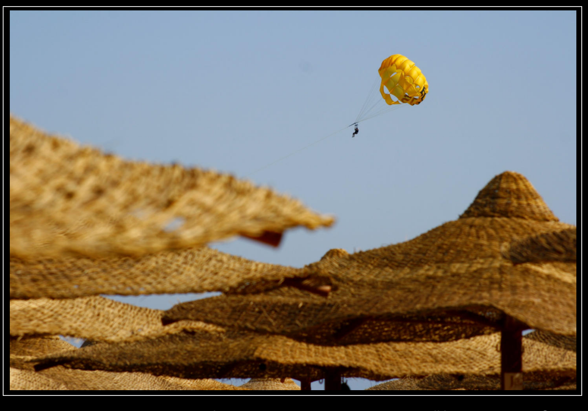
• Any concern about a successful landing should not deter you to take off from time to time. © Flying Tourist whiling away the boredom with a paraglider, while umbrellas are sweating beneath him (Makadi Bay) – November 2012