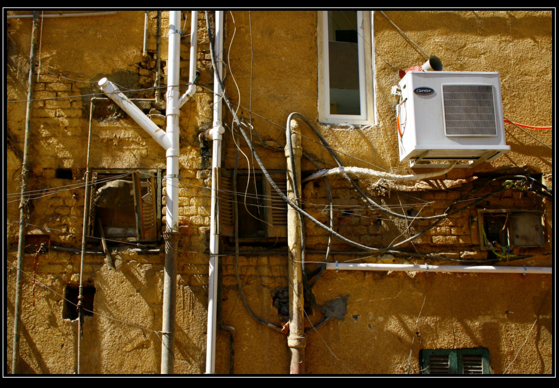
Life may seem chaotic. The decisive factor is how vivid power and energies flow in us. © Bonus-Picture: Various cables and electrical lines supply the unprotected hopefully less confused inhabitants of the old town of Aswan – Nov. 2012