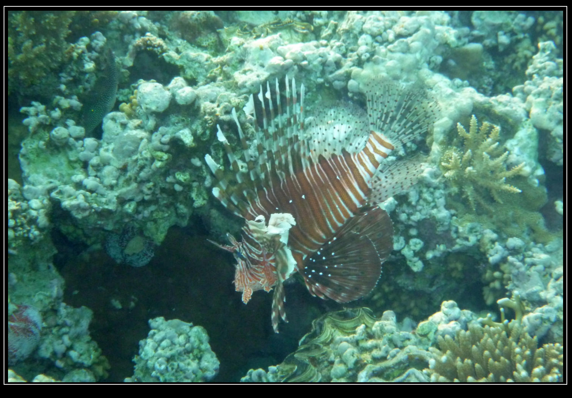
To recognize the greatness of creation it is sometimes worthwhile to dive into other worlds. A beautiful, even though highly toxic fire fish circles around the battered house reef of Makadi Hotel Chain – November 2012