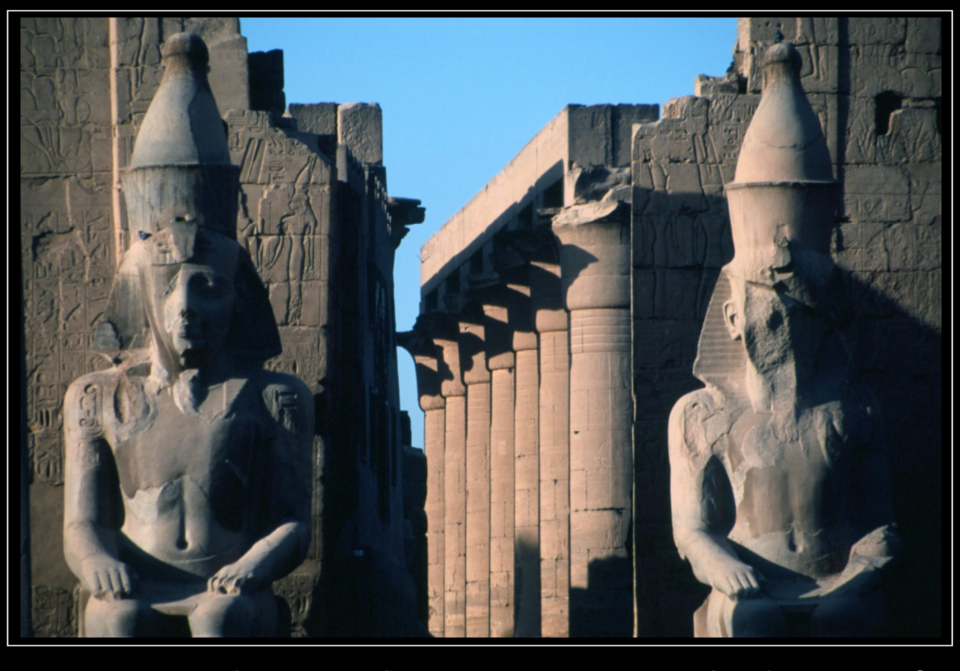
• Find your essence. Open the gates of your heart and look the guardians of your fears in the eye. © Two colossal statues of Pharaoh Ramses II gracefully adorn the entrance to the large colonnade in the Temple of Luxor – November 2012