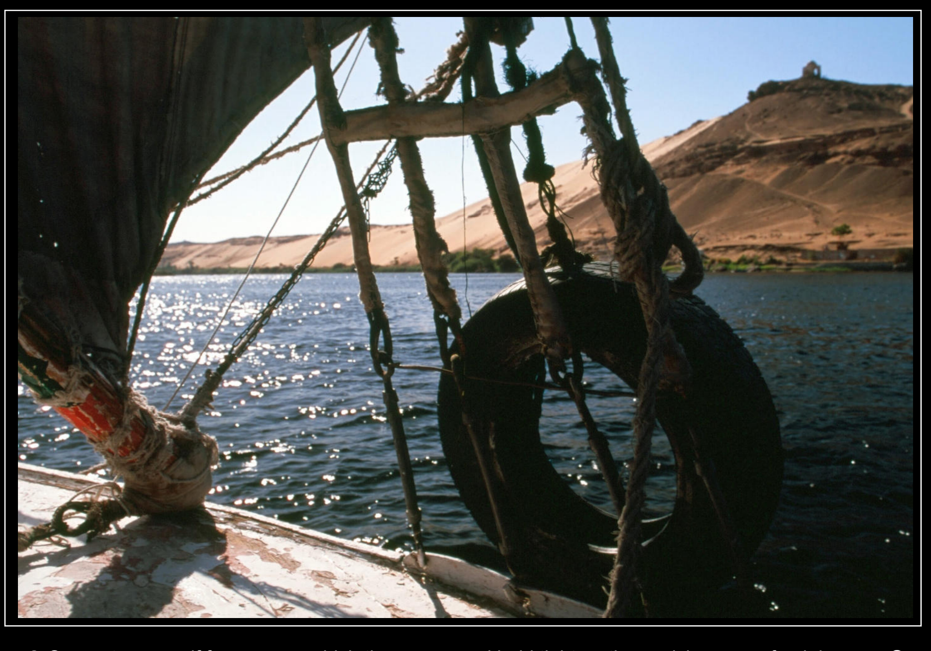
Separate yourself from ropes, which tie you up, and hold tight on those giving you a fresh breeze. Looking at the mausoleum of Aga Kahn during a safe sailing trip on a felucca to Kitchener Island just outside of Aswan – November 2012