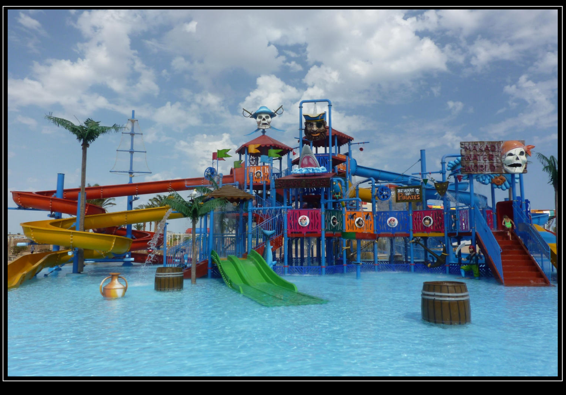
● Feel how good it does to slide again as a pirate over all the conventions and rules. With over 25 slides, the water park in the Makadi Bay is not only great fun for children (30 km South of Hurghada) – November 2012