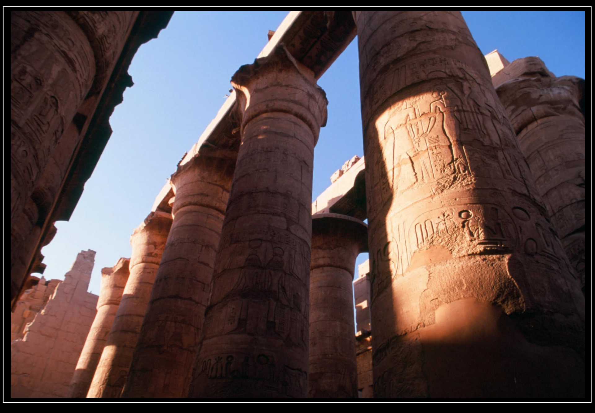
© Give the supporting pillars of your life sufficient care, light and love. ☺ The forest of columns (number: 136 pieces, size: 10 m, height: 21 m) in the temple complex of Karnak makes just speechless (Luxor) – Nov. 2012