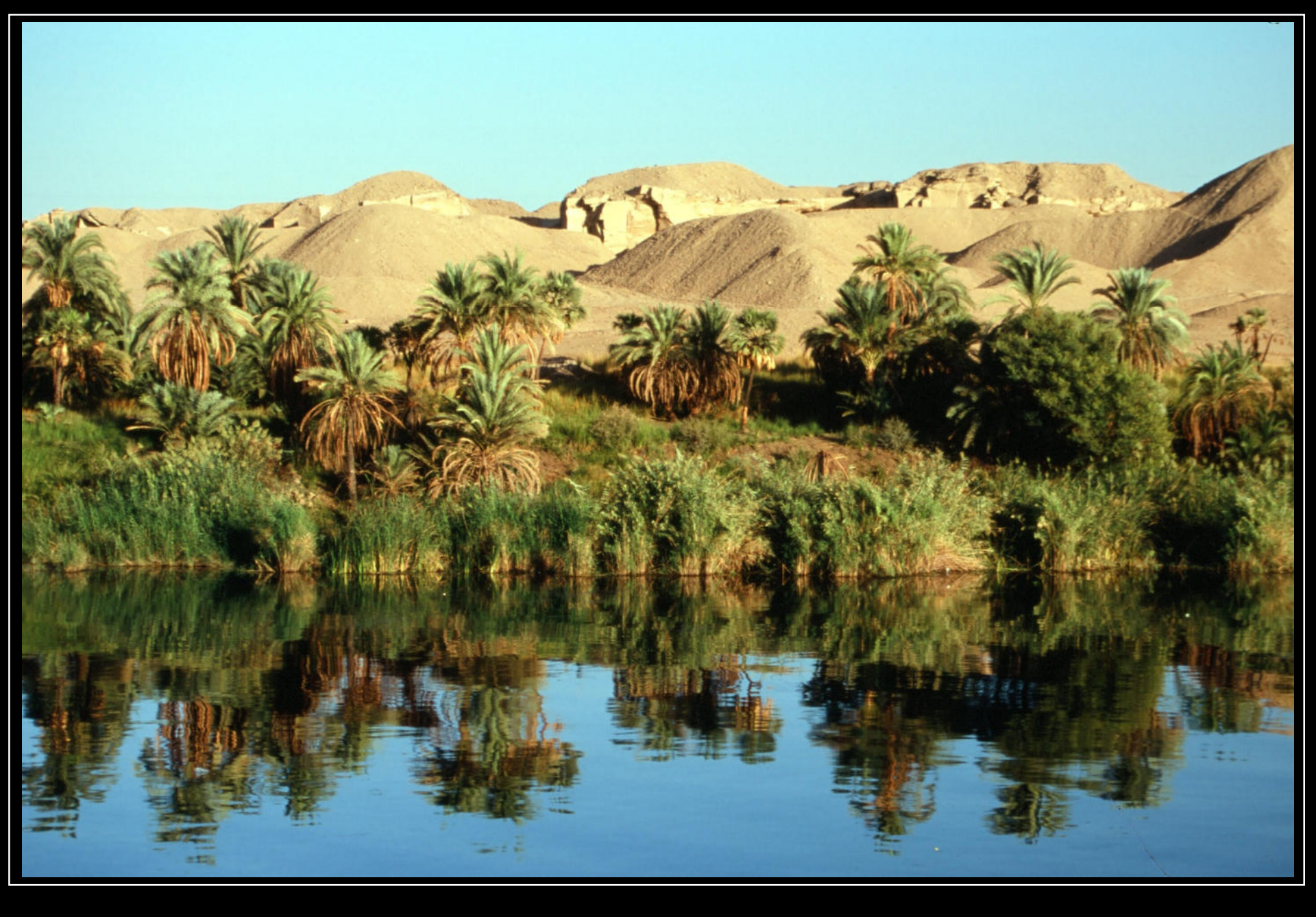
● Harness the power of reflection. It is a fascinating way to self-knowledge. ⑤ A typical landscape along the river Nile: fertile farmland, date palms and, where the water cannot reach, desert sand – November 2012