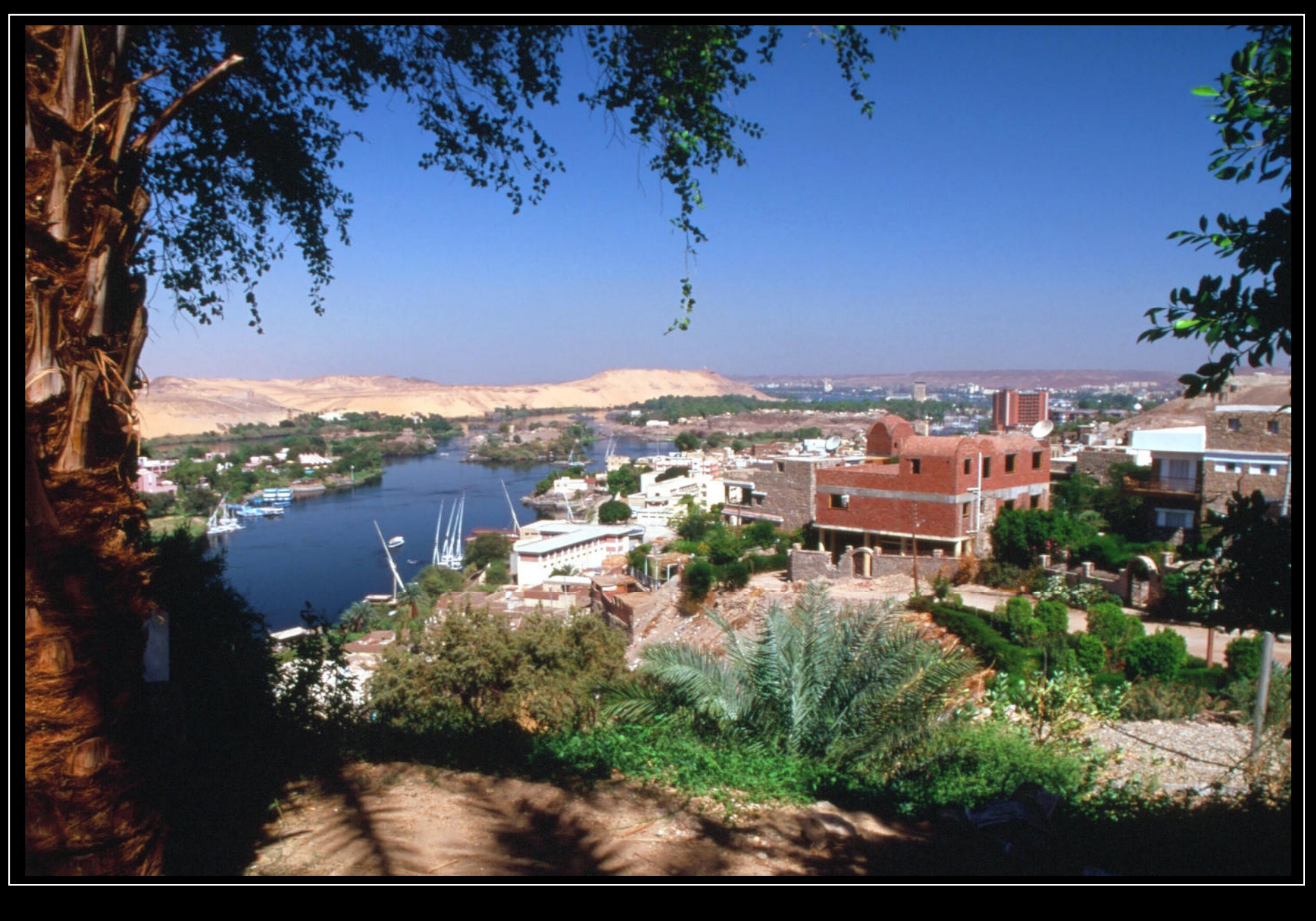
• Welcome to the land of the deserts, where cultural wonders, green oasis and colorful fish fascinate. © View from a restaurant on the green islands of the river Nile and their noble houses, nearby the Aswan dam (Nile River Cruise) – November 2012