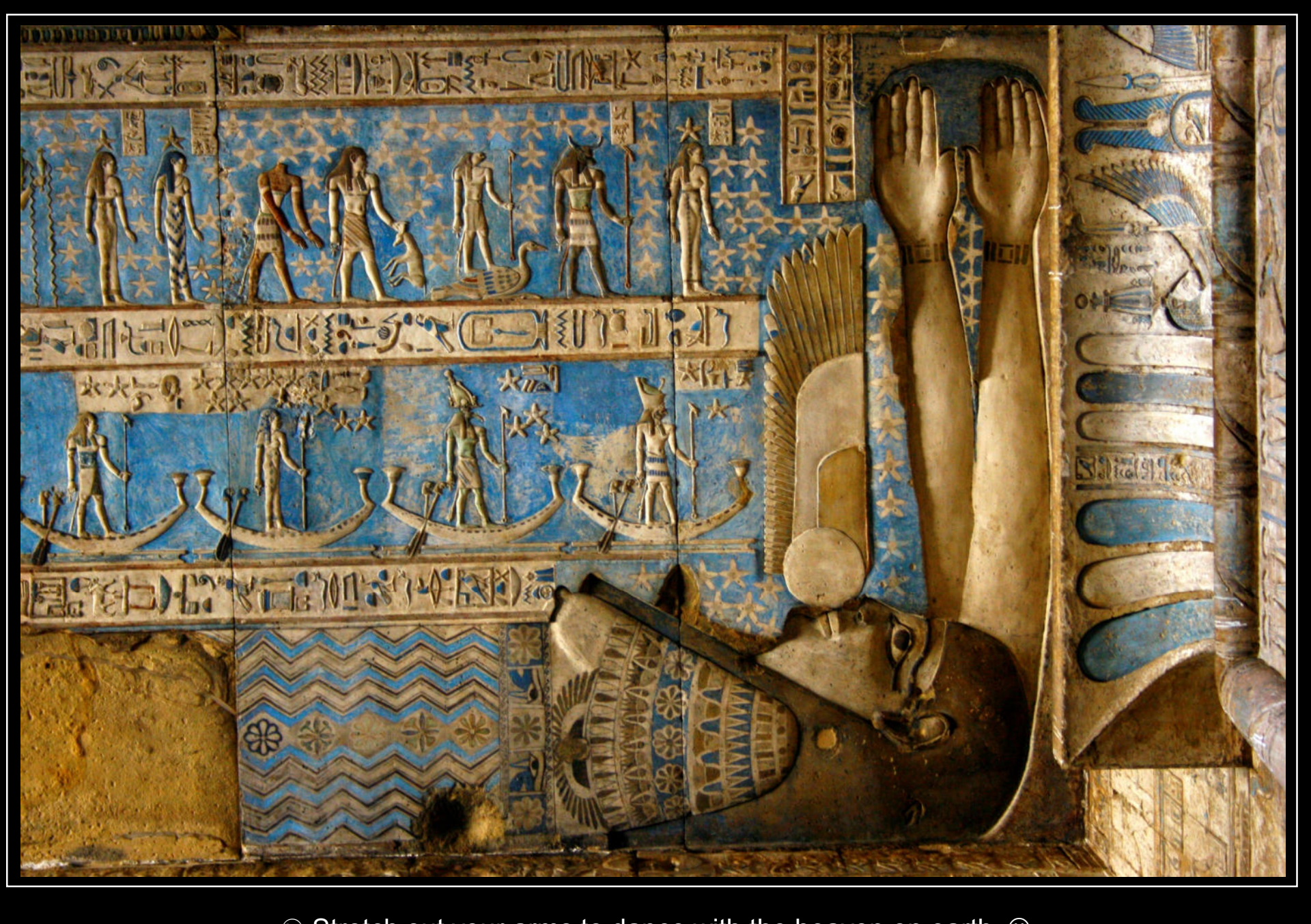
Stretch out your arms to dance with the heaven on earth. © In the temple of Hathor, the goddess of love and joy, shines the goddess of heaven Nut in a more than 2000 years old blue (Dendera) – Nov. 2012